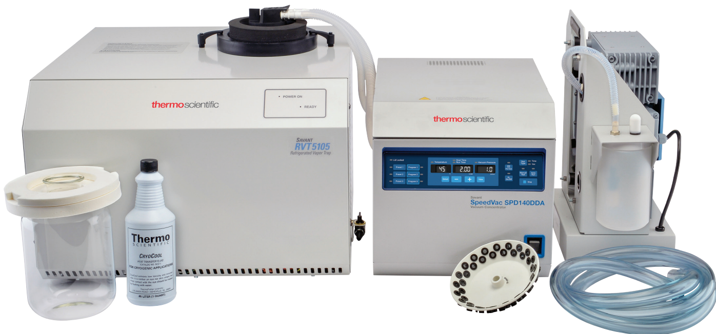
SpeedVac SPD140P1 Vacuum Concentrator Kit