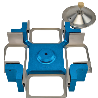
Savant PRO-10 Rotor Kit